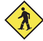
Figure G: Comparison of Pedestrian Fatalities per 100,000- Metropolitan Counties, Ages 55 and Older (2002-2005)